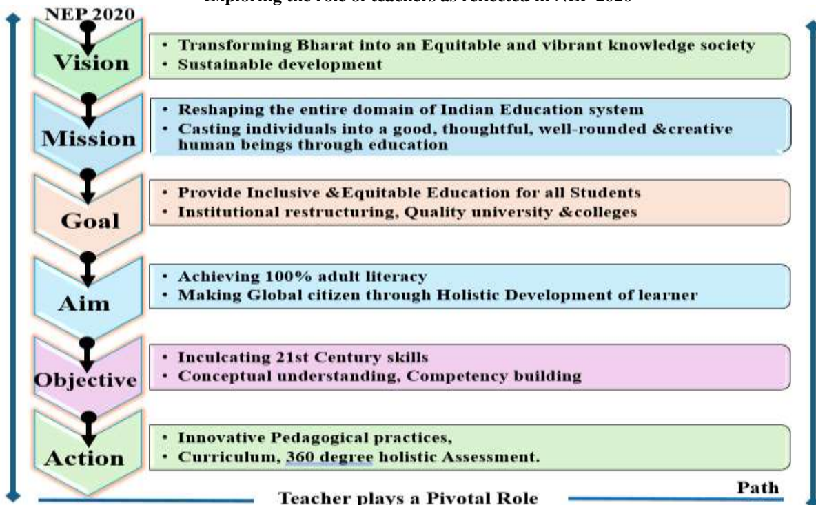
Exploring the role of teachers as reflected in NEP 2020

Strategic recommendations for transforming the faculty and teachers of HEI according to the guidelines of NEP 2020.