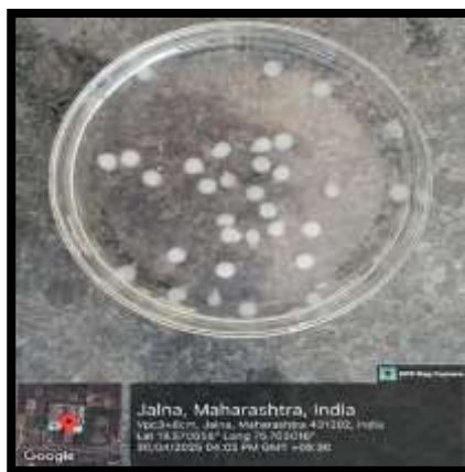
Fig (4B) Beads After Swelling