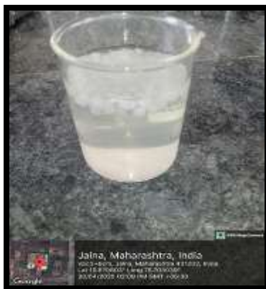
Fig (6) Floating Beads

demonstrated excellent in vitro floating properties in 0.1N HCl. Figure 6.