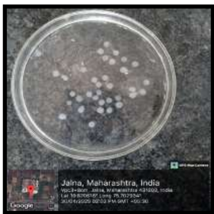
Fig (4A) Beads before swelling