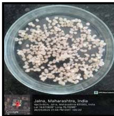
Fig. (3) Air Dried Beads