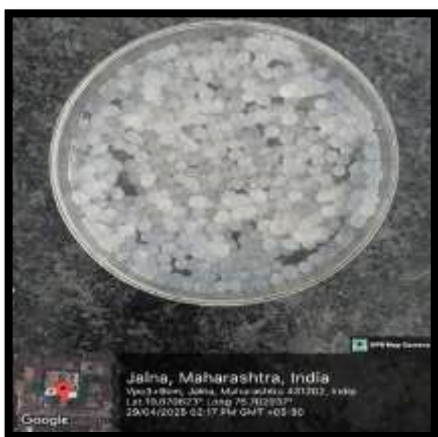
Fig. (2) Magnesium Hydroxide Bead

A sodium alginate solution containing Mg (OH) 2 was carefully dropped or extruded into a calcium chloride solution using a syringe from a height of 5 cm to form uniform spherical beads. These beads were then allowed to stand in the calcium chloride solution for 15 minutes to develop a stable bead structure, during this time they were not disturbed to prevent damage. After 15 minutes, the beads were removed from the solution and washed twice with distilled water to eliminate excess calcium chloride and prevent unwanted cross-linking. The beads were dried. The beads were air-dried at room temperature, ranging from 20-25°C, for a duration of 12 hours. To preserve their stability and effectiveness, the alginate beads must be stored in a dry environment, such as airtight containers. 18,19 Figure 2 and 3.