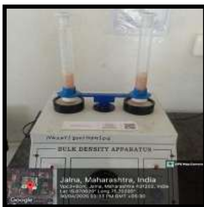
Fig. (5) Bulk Density Apparatus

The ability of alginate beads to float in gastric fluid depends on their bulk density. Beads with a density lower than gastric fluid (1.004-1.010 g/ml) exhibit floatation. F 1 and F 2 alginate beads have densities of 0.8699 g/ml and 0.952 g/ml, respectively, allowing them to float well. F 1 beads have a higher tapped volume (22 ml), indicating a more porous structure, while F 3 beads have a lower tapped volume (19 ml), indicating a denser nature. Figure 5.