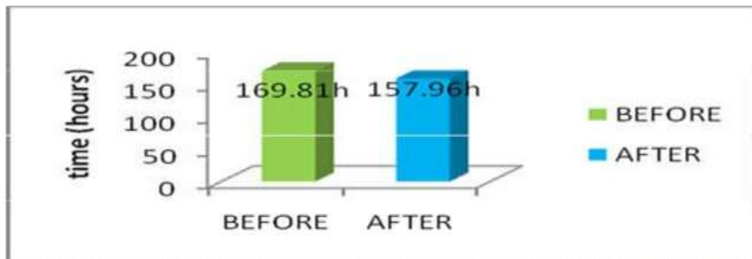
Figure 3: Sales order processing lead time comparison before and after improvements

been reduced. If we look at the hours reduced, it is a small value compared to overall time which is 169.81 hours. But, 11.85 hours time is more than one day because of 8 hours working time. That's a long time to waste.