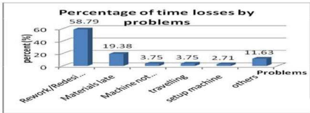
Figure 1: Percentages of Time Losses by Problems

Data already collected before started kaizen steps. From counter measure are proposed in why-why analysis, each current procedures of sales order processing flow are studied.