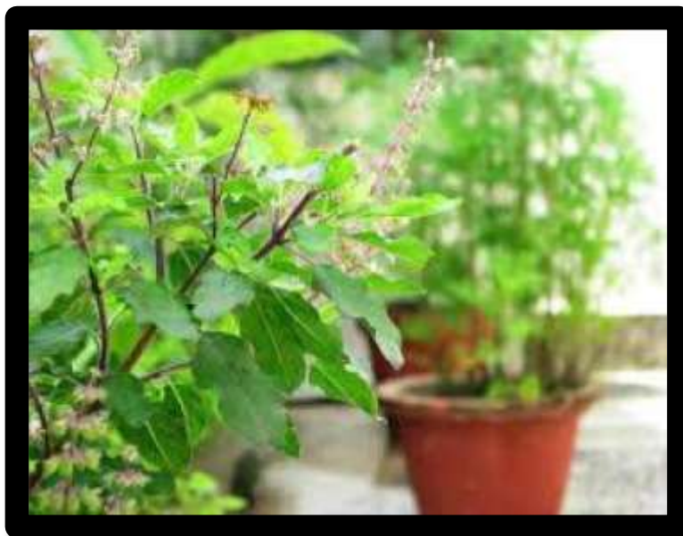
Fig. 4- Tulsi