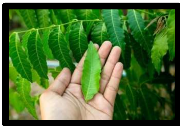
Fig: 3- Neem