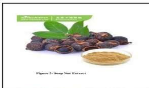
Figure 2- Soap Nut Extract