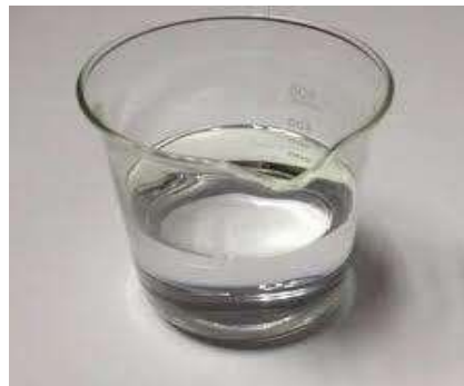
Fig . Rose Water