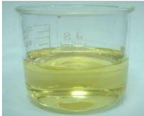
Fig. Lemon Oil