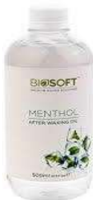
Fig. Menthal Post Wax Lotion