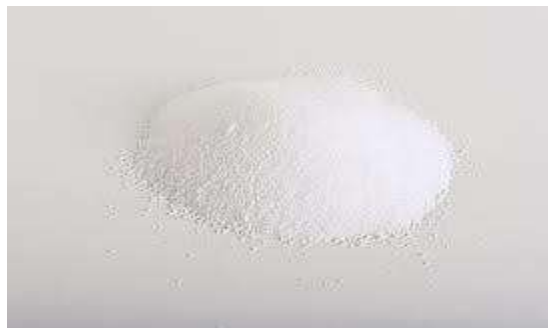
Fig. Stearic Acid