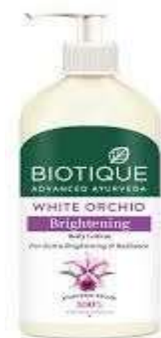
BIOTIQUE White Orchid Brightening Body Lotion

The body lotion is made up of extremely effective herbal elements that give the skin a dull, radiant appearance.