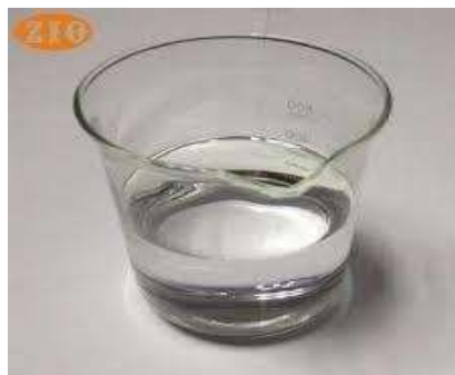
Fig. Coconut Oil