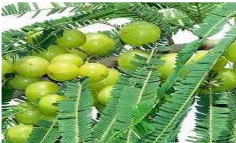
Fig. Emblica Tree

The lotion was created by quickly combining the non-polar phase with the polar phase to prevent the separation of the water and oil phases. After melting together, the non-polar phase was gradually added to the heated polar phase mixture. Because P.E. has properties suitable with water and A.S. has characteristics compatible with oil phase Contents according to phase are provided below, the following formula was utilised for the manufacture.