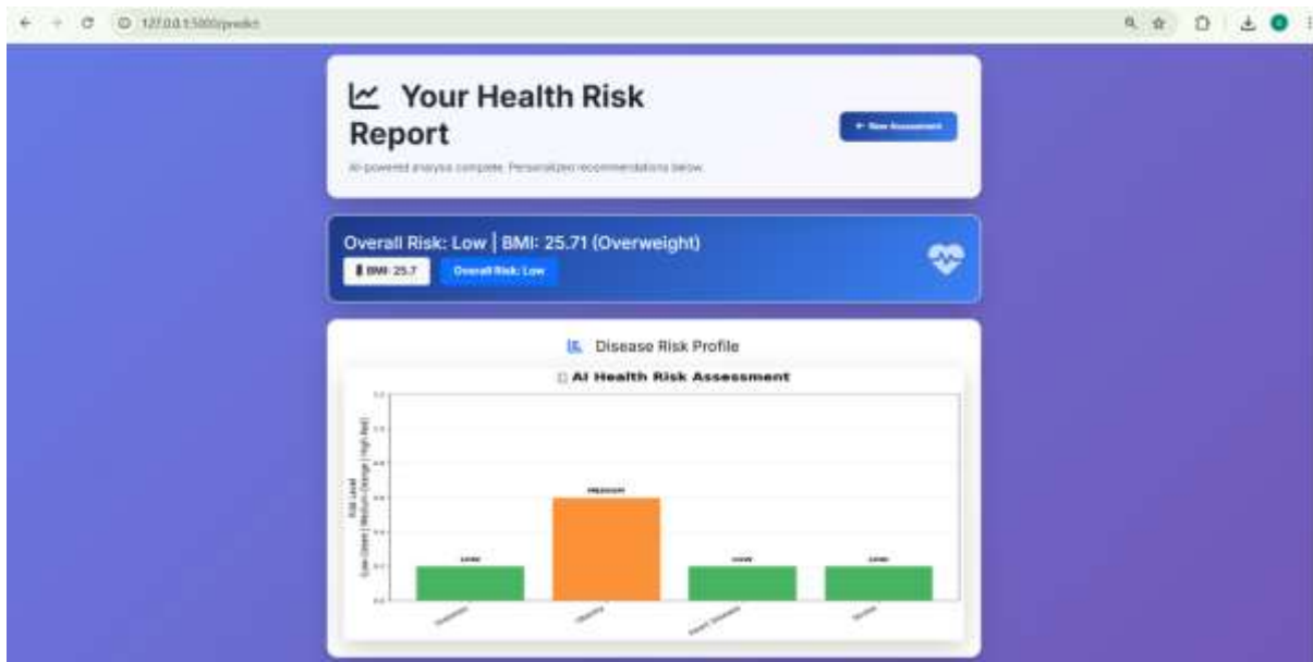
Fig.No: 2 AI Health Risk Assessment

This chart provided the risk assessment for the given data. This showed that the pressure level is high for the person.