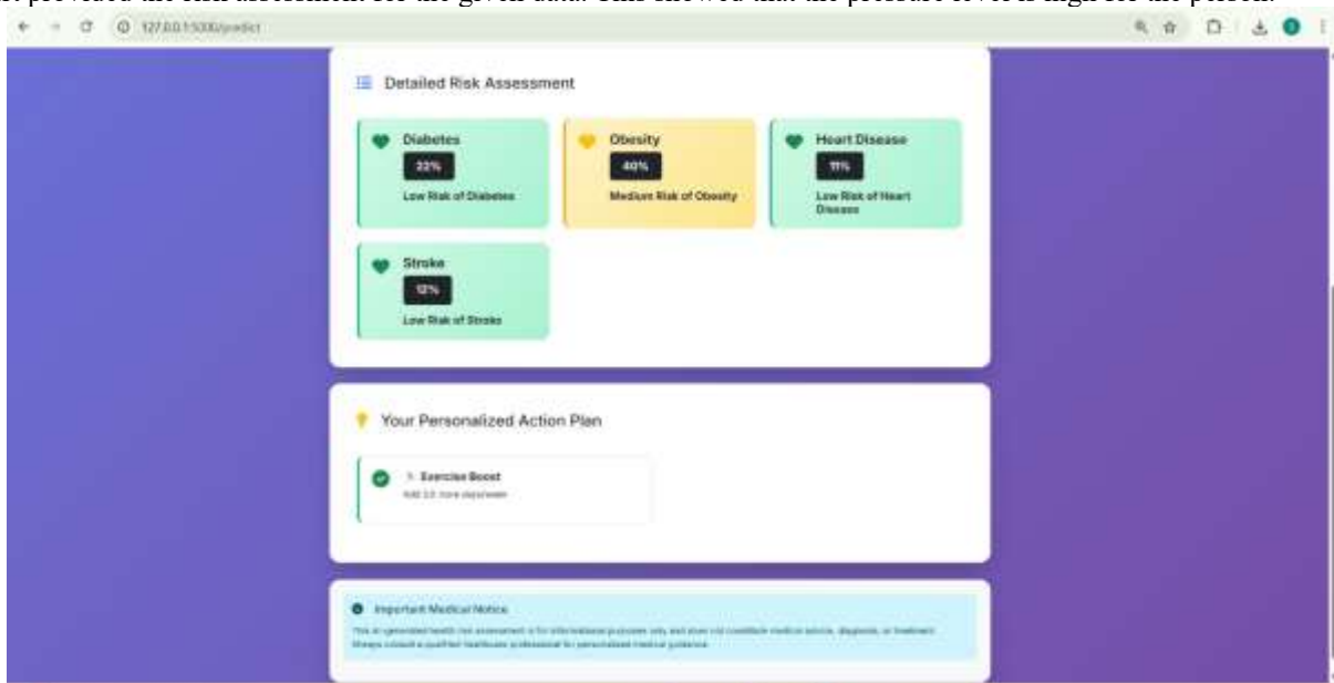
Fig.No: 3 Detail Risk Assessment

This chart provided the risk assessment for the given data. This showed that the pressure level is high for the person.