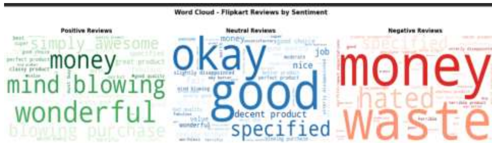
Fig No:1 WORD CLOUD