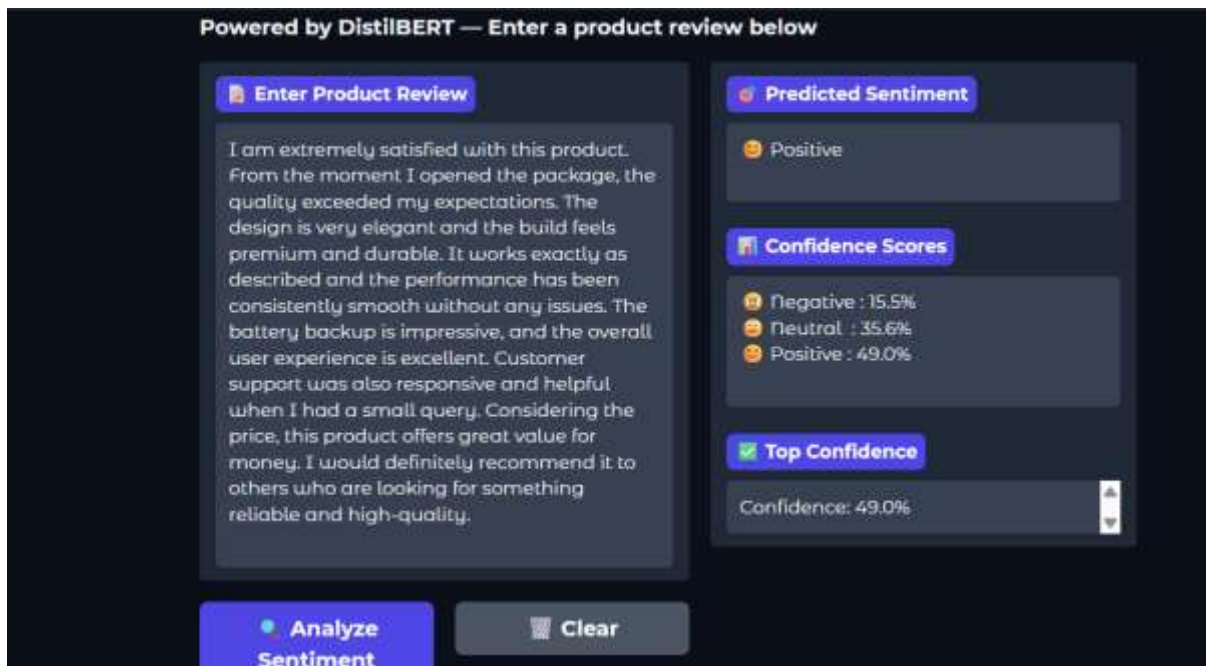
Fig No:2 Positive Sentiment Prediction