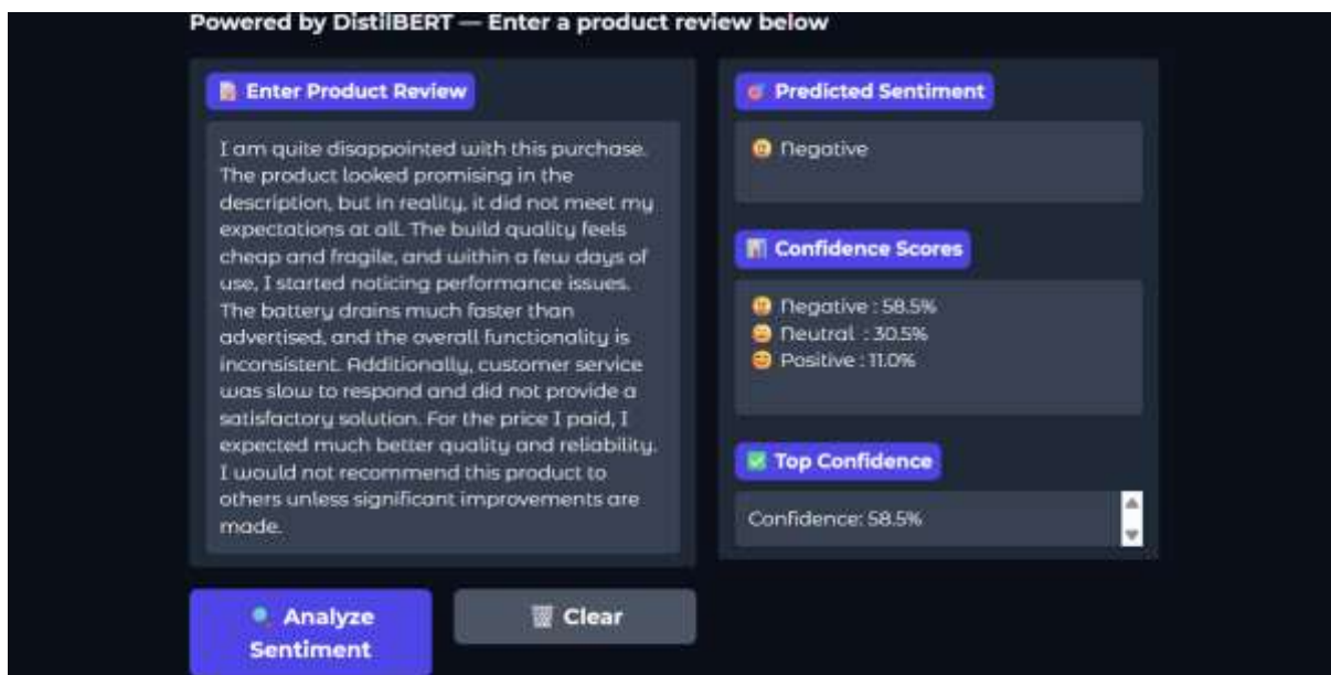
Fig No:3 Negative Sentiment Prediction